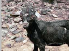
A young goat affected by the viral disease peste des petits ruminants

LODWAR, 23 July 2008 (IRIN) - Recurrent outbreaks of the viral livestock disease peste des petits ruminants (PPR), which affects goats and sheep, are exacerbating poor food security in the mainly pastoralist Turkana region of Northwestern Kenya.